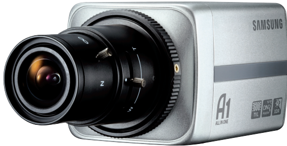
Lens not included