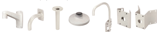
SBP-300WM1 SBP-300WM SBP-300CM SBP-300HM2 SBP-300LM SBP-300PM SBP-300KM