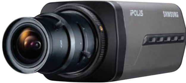
* Lens not included